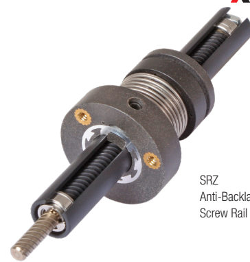
SRZ Anti-Backlash Screw Rail Linear Actuator

By eliminating the need for external rail-to-screw alignment, the Screw Rail simplifies the design, manufacture and assembly of motion systems. The coaxial design saves as much as 80% of the space used by a two-rail system and is generally less expensive than the equivalent components purchased separately. An added benefit is the ability to get three-dimensional motion from a single Screw Rail.