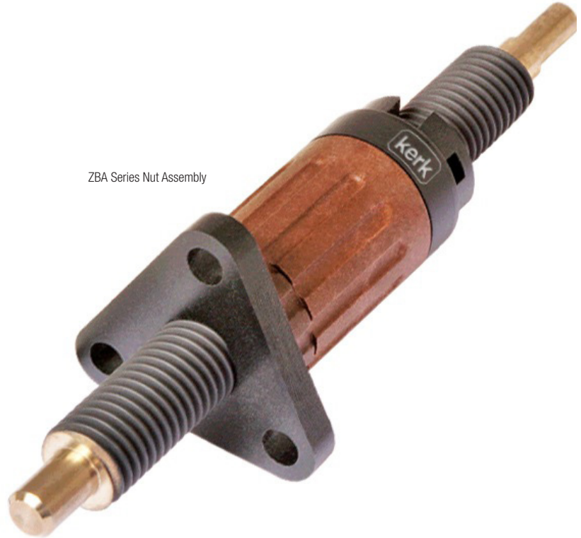
ZBA Series Nut Assembly