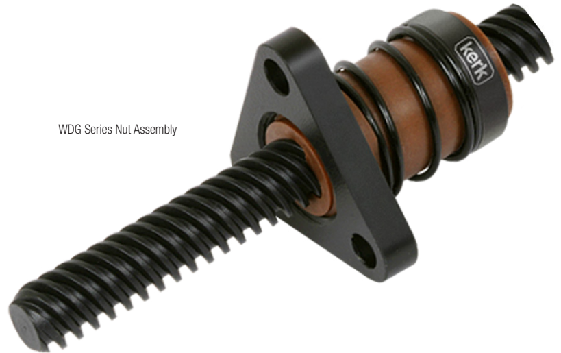
WDG Series Nut Assembly

Anti-backlash life is defined as the nut's ability to compensate for wear while maintaining its zero backlash properties. Above life data is based on 25% of the dynamic load rating. Life will vary with loading, operating environment, and duty cycle. The longer screw leads generally provide longer life.