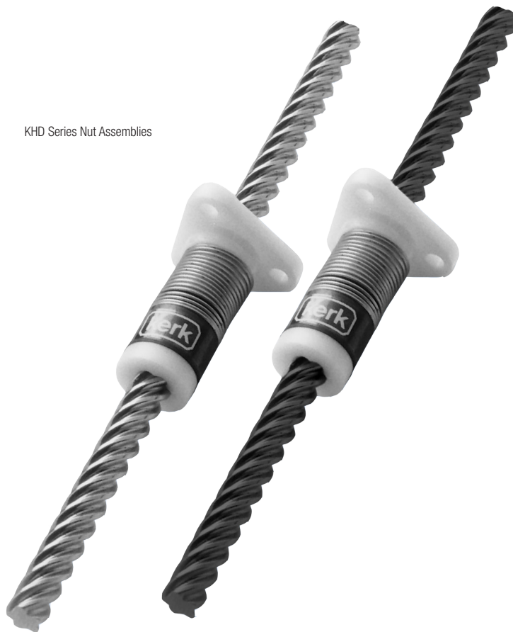
KHD Series Nut Assemblies

Eliminates the need for load compensating preload forces. The KHD Series anti-backlash assembly makes use of the Kerk patented AXIAL TAKE-UP MECHANISM (see Lead-screw Assemblies: Anti-Backlash Technologies section) to provide backlash compensation. The unique split nut with torsional take-up provides increased load capacity and axial stiffness over comparably sized ZBX units. Although the KHD offers high axial stiffness, frictional drag torque (1-3 oz.-in.) is very low. The anti-backlash mechanism in the KHD unit eliminates the need for load compensating preload forces. The assembly consists of a 303 stainless steel screw mated with a self-lubricating polyacetal nut. End machining to customer specifications and Kerkote® TFE screw coating are optional.