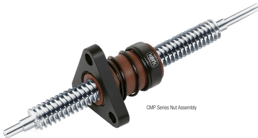
CMP Series Nut Assembly

Features a compact anti-backlash nut assembly for light load applications. The CMP Series anti-backlash assembly utilizes a general purpose self-compensating nut in an exceptionally compact package. This allows equipment designers to utilize smaller assemblies without sacrificing stroke length. The CMP anti-backlash nut design is also ideally suited for applications using grease or oil. The standard CMP Series assembly utilizes a self-lubricating acetal nut, axially preloaded, on a 303 stainless steel screw. End machining of screw to customer specifications and Kerkote® or Black Ice® TFE screw coating are optional. Various axial compression springs are also available, depending on application requirements. Please consult factory for details.